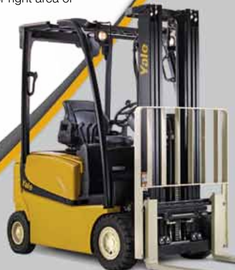
Truck shown with optional equipment.