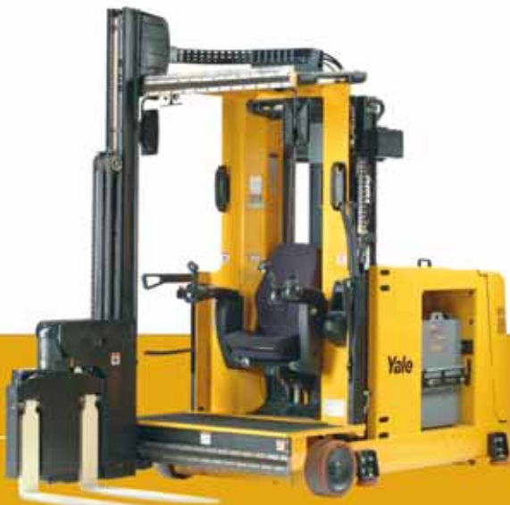
Truck shown with optional equipment