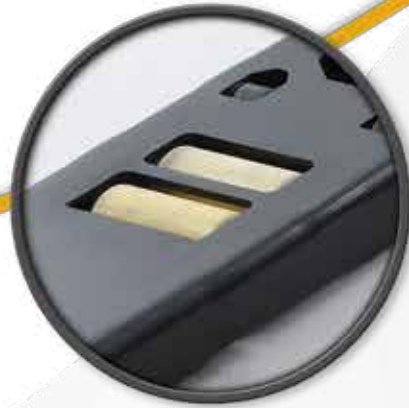
Tandem load wheels