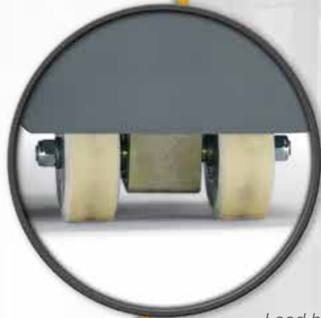
Load bearing dual caster wheel