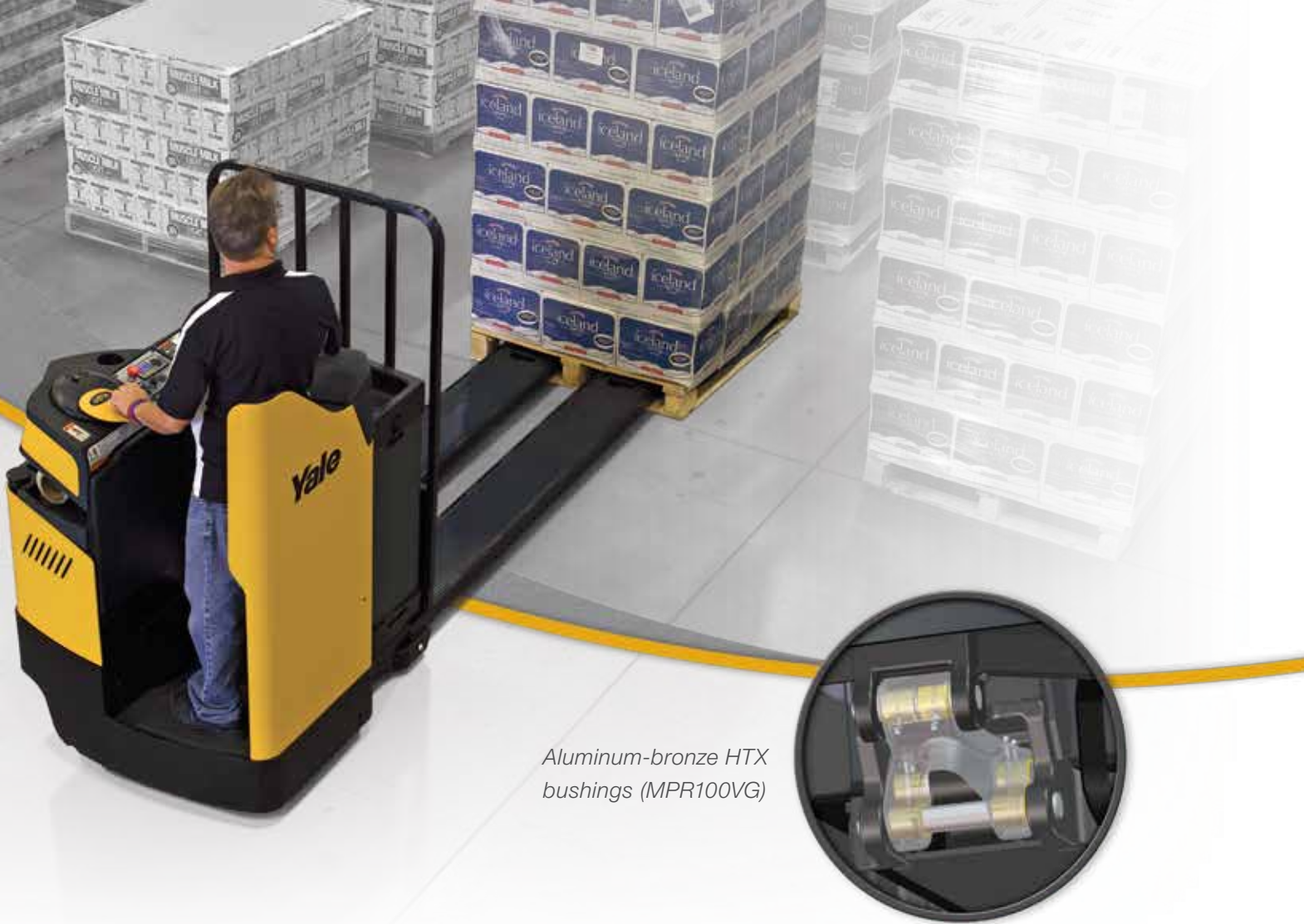
Aluminum-bronze HTX bushings (MPR100VG)