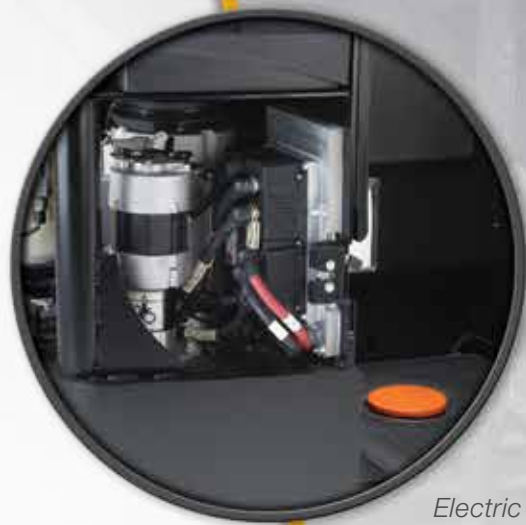
Electric steering motor

Our standard storage compartment, combined with the optional battery-mounted convenience tray, provides 84% more storage than the leading competitor. There's plenty of room for virtually anything an operator may need during the shift, for example two standard stretch wrap rolls, barcode labels or papers. The built-in bungee cord will prove useful for securing loose items such as pick tickets.