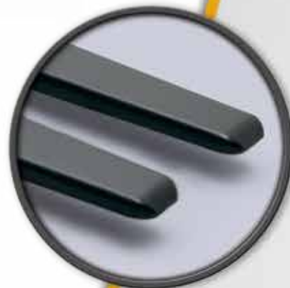
Advanced pallet entry/exit system