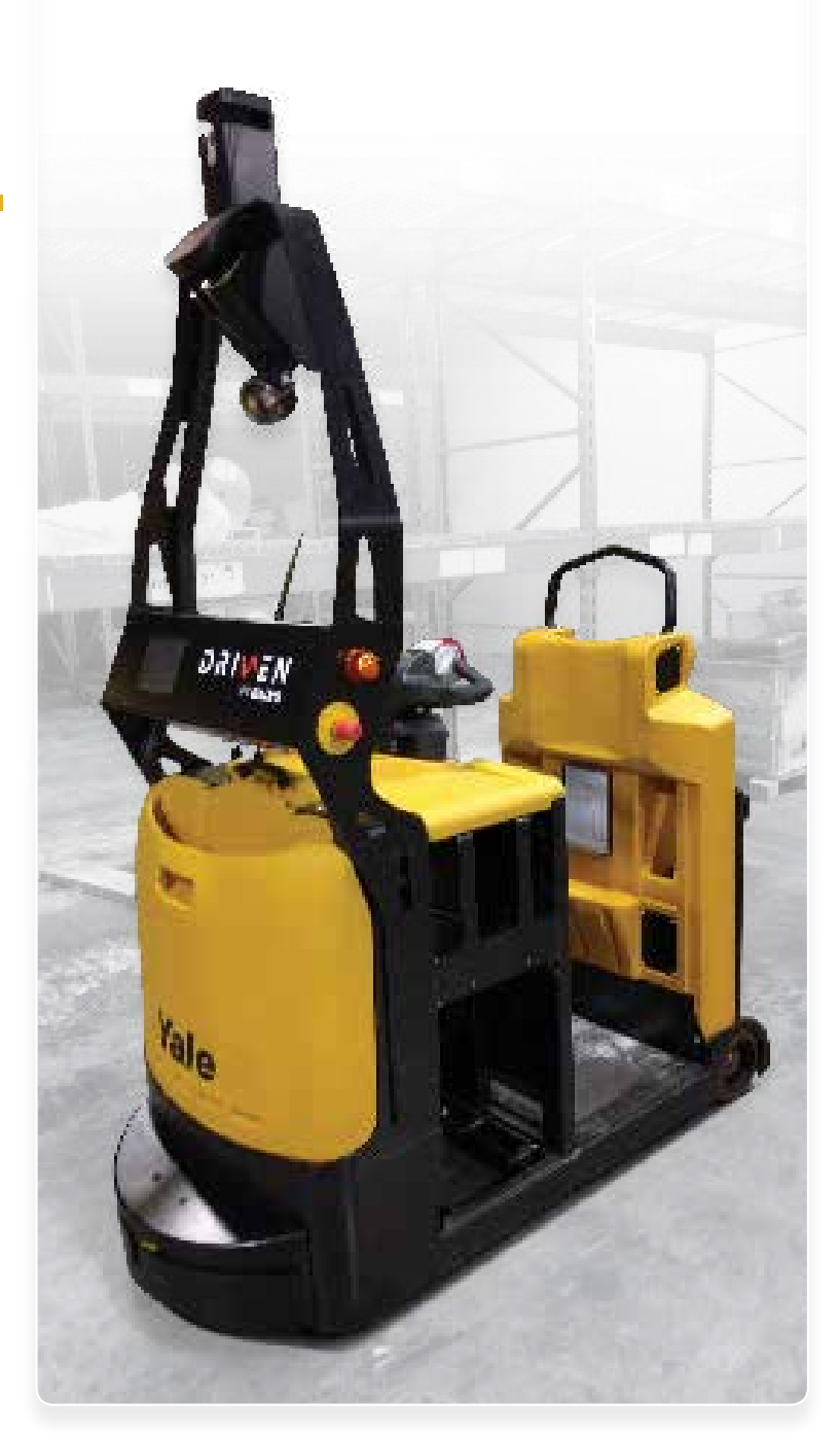
HMI - Human Machine Interface

The robotic lift truck manager software provides overall management of robotic lift trucks in real-time. It controls traffic, assigns transport orders to individual robotic lift trucks and interfaces with systems such as ERP (Enterprise Resource Planning) and WMS (Warehouse Management System), or equipment such as automatic doors, conveyors and production machines using COMBOX modules.